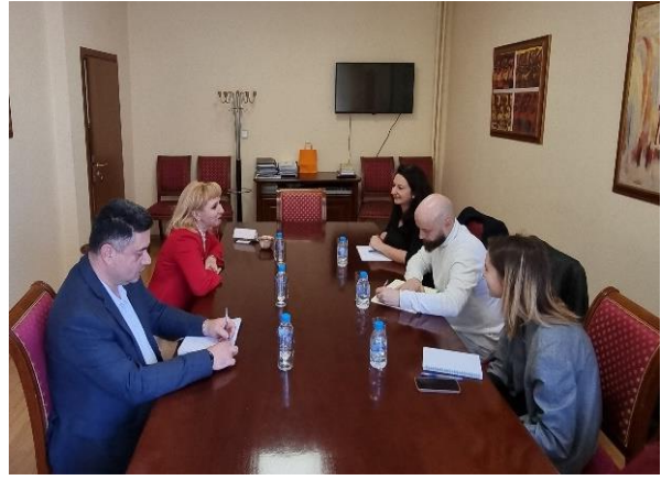
March 2023 – Amnesty International Bulgaria Leadership Presentation.